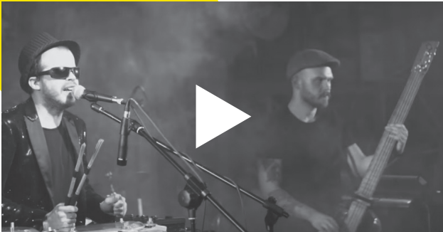
Rock and Roll the Blues (Official Video)