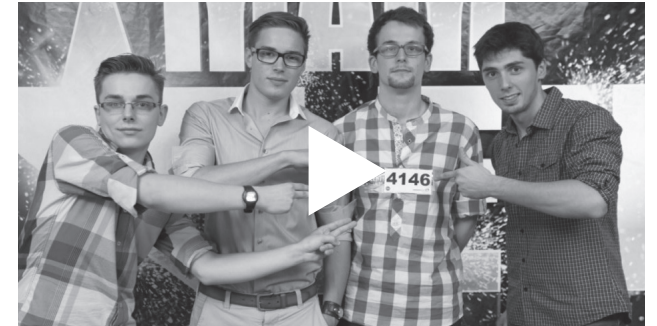
Got Talent (Final live)