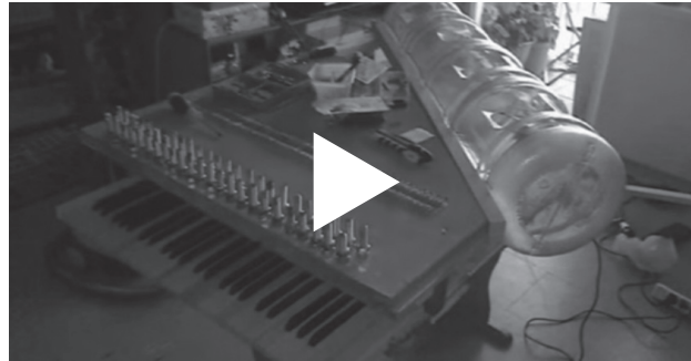
Construction of Klawiszon