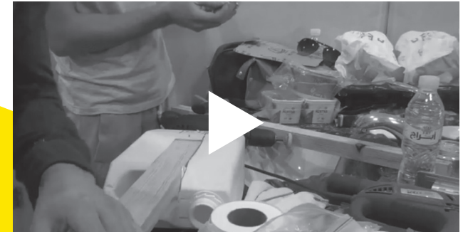
Construction of HalunoBass in Kuwait